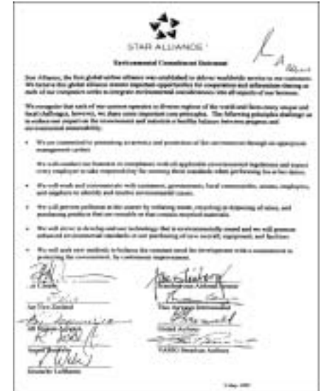
Star Alliance Environmental Commitment Statement