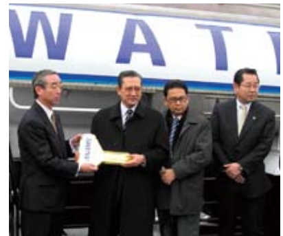
Drinking water tanker donated to Indonesia

the provision of free transportation to medical support personnel, free shipment of food, blankets, and other relief goods, and the donation of an anti-freeze tanker that we converted into a vehicle for the transportation of drinking water. ANA's active participation in support activities was highly evaluated, and in May 2005 the Company was awarded the Medal with Dark Blue Ribbon from Prime Minister Junichiro Koizumi.