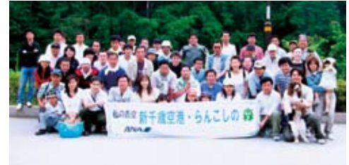
Tree planting activities in Rankoshi no Mori

of the end of March 2006, we had planted trees in 11 locations.