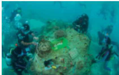
"My Aozora" Tyura Sango Reef Restoration" activities in Onnason, Okinawa Prefecture