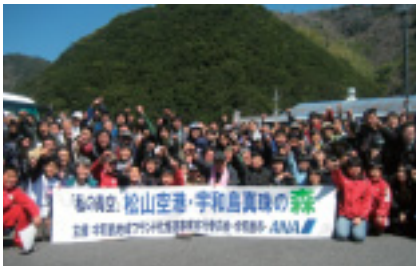
The Aozora Forestation Project after forestation near Matsuyama Airport, Uwajima Shinju