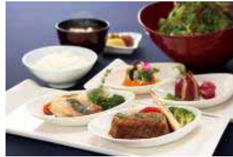
Image of First Class Meal