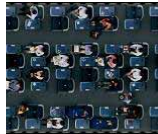
ANA BUSINESS STAGGERED