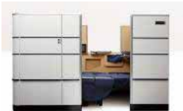
ANA FIRST SQUARE