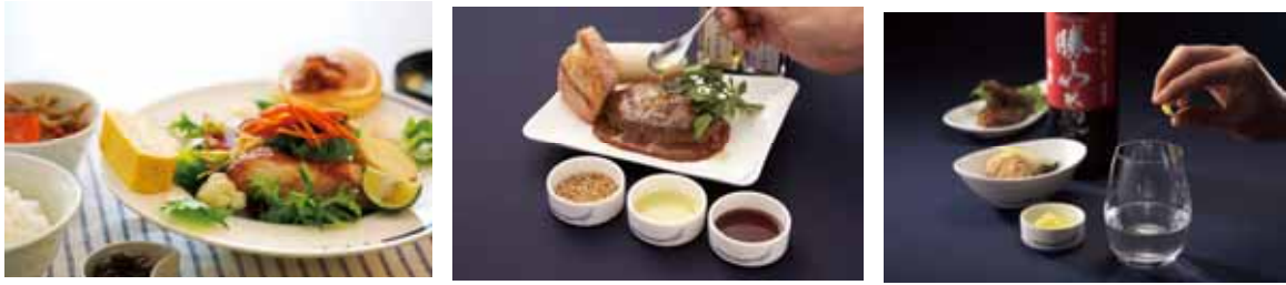
Examples of meal and drink

*The photographs are images, and it will differ according to routes and seasons