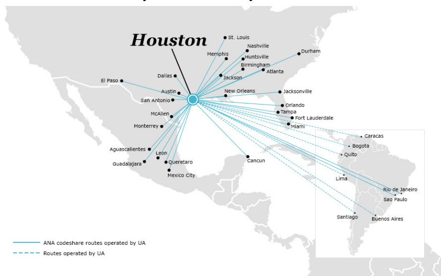
<United Airlines' major destinations beyond Houston>

Convenient connections from Houston on the extensive network of United Airlines, ANA's joint venture partner, will provide access to major cities in Central and South America as well as domestic destinations within the US. Through code share flights with United Airlines, passengers can enjoy improved access to cities in Mexico as well as other 19 US domestic destinations.