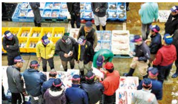
Numazu Fish Market, Shizuoka Pref. 静冈县沼津鱼市场

From the observation deck, you can see Numazu Port Large Flood Gate and Observation Deck (View-O), the largest observation flood gate in Japan, created to protect the port and its citizens from tsunami attacks. A 360-degree panoramic view of Suruga Bay can be enjoyed 30 meters above ground level, a distinct pleasure that satisfies your eyes as well as your palate and appetite.