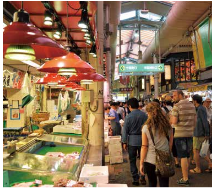
Omicho Market, Ishikawa Pref. 石川县近江町市场

商贩和客人们欢快而充满自信的吆喝声回荡在近江町市场。这条熙熙攘攘的街道位于金泽市中心，大约 300 年来为本地人提供各种新鲜食品。狭窄的街道两边有大约 180 个摊位出售各种琳琅满目的商品，从美食、水果、泡菜、小吃到鲜花、衣服，可谓应有尽有。这个全国知名的市场是热门观光景点，来到这里的游客请勿错过。