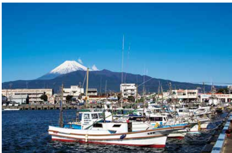
Numazu inner harbor, Shizuoka Pref. Photo courtesy of Numazu City 静冈县沼津内港，图片由沼津市提供

沼津 是一座历史悠久的古镇，过去作为东海道上的驿站城镇盛极一时。位于伊豆半岛的沼津气候温和，有广阔的海景和富士山的壮观美景。除此之外，沼津港还是知名的美食之城，有来自骏河湾的新鲜且营养丰富的海鲜。