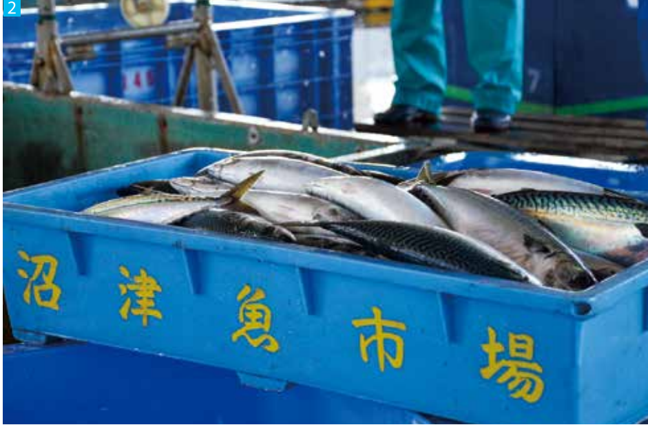
1 Tourists have fun at Omicho Market, Ishikawa Pref., © Fast & Slow/PIXTA 游客们在石川县近江町市场观光 © Fast & Slow/PIXTA