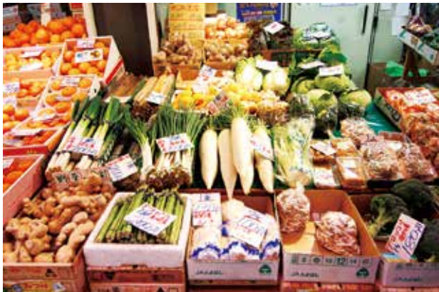
Omicho Market, Ishikawa Pref., 石川县近江町市场

Omicho Market starts at around 9 AM. Come and have a casual stroll around the place, where you can enjoy friendly exchanges with shopkeepers and locals for a once-in-a-lifetime experience of Japanese culture, all within the bubbly atmosphere of lively seller and curious customer.