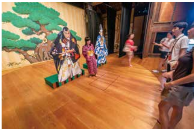
Kureha-za Theater, built in Osaka, 1968 吴服座歌舞伎剧场，1968年建于大阪

Another "don't miss it" is the brick facade and lobby of the Imperial Hotel designed by Frank Lloyd Wright. It's one of the American architect's most famous works. And even in this reduced state, it doesn't fail to impress.