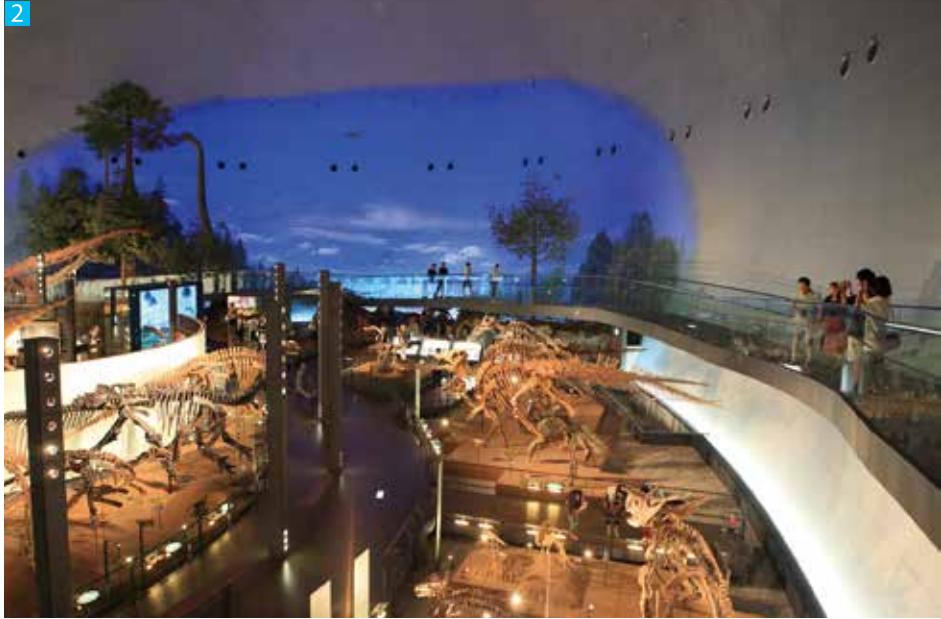
1 Kitasato Institute, built in Shirogane, Minato-ku, Tokyo, 1915, Meiji-mura, Aichi Pref. 北里研究所, 1915 年建于东京港区白金, 爱知县明治村