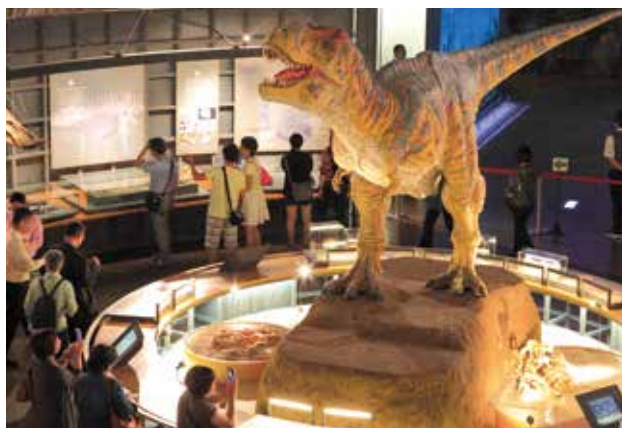
Dinosaur World (1F), a huge oval-shaped space without pillars, exhibits 44 dinosaur skeletons.

Other choices included watching museum specialists clean rocks at Fossil Lab, gallery talks by museum scientists (on select days), and a two-hour tour of the museum's field station for hands-on paleontology sessions (late April to early November).