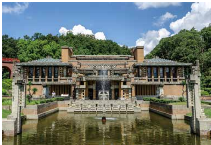
Main Entrance Hall and Lobby, Imperial Hotel, by Frank Lloyd Wright, 1923 帝国饭店的门廊和大厅，弗兰克·罗伊德·莱特于1923年设计建造

如果您想逃离日本城市的混凝土森林，寻求一次轻松温和、启迪心灵的旅程，不妨考虑一下距离名古屋站仅有一小时车程的明治村，它坐落于入鹿湖畔长满低矮树木的丘陵之中。