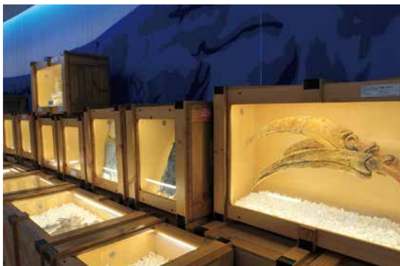
Entrance hall (2F), where the History of Life is exhibited 入口大厅 (2楼)，生命的历史主题展览

福井县被誉为恐龙王国，当一条古鳄鱼的骨骼在胜山市的山谷地区被发现以后，1989年起发掘工作就正式开始了。已发现的五种恐龙及其他大量化石中包括了“福井盗龙”，这是第一种学名以日本地名命名的恐龙。