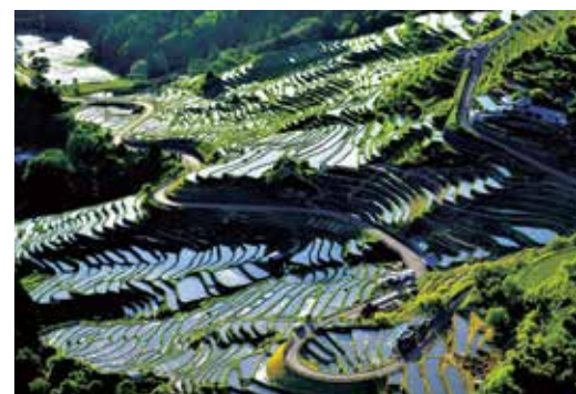
Maruyama Terraced Rice Fields, Mie Pref. 三重县丸山梯田

Of special spiritual significance is Mie's Iseji, a 170-kilometer trail connecting the revered shrines of Ise Jingu and Kumano Sanzan. Enjoy stone-laid paths and primeval forests of Kumano Kodo as you hike panoramic passes of cryptomeria and bamboo trees and view the Pacific Ocean, beautiful rice terraces, and other breathtaking sights along this sacred way.