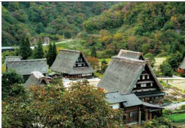
Saganuma Gassho-style Village, Toyama Pref. 富山县菅沼合掌村

相仓村保留了23处合掌造建筑，如今作为民俗博物馆为游客提供乡村生活、旅馆住宿、纪念品商店等信息。菅沼村则有9处受保护的合掌造建筑。山区的降雪厚度可达到2至3米，因而冬季交通运输较为困难，五箇山豆腐也就成为当地的重要主食。这种豆腐做法传统，质感紧实，能够用细绳捆扎起来随身携带，不影响您体验其他的当地特色文化，如传统民歌、和纸、温泉等。记得一定要品尝五箇山豆腐哦！