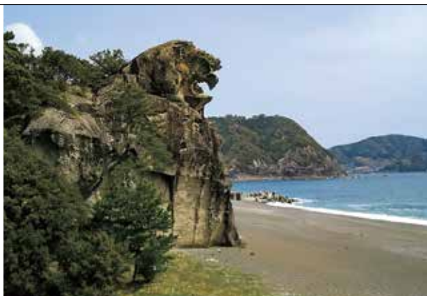
Shishi-iwa, Shichiri Mihama Beach, Mie Pref. 三重县七里御海滩狮子岩

三重县伊势路具有特殊的宗教意义，这是一条长170公里的小路，连接着备受尊崇的伊势神宫和熊野三山。您可以在徒步穿越由柳杉、竹林组成的全景通道时，尽情享受石头小径和熊野古道的原始森林，远眺太平洋与梯田美景，感受神道沿路其他令人叹为观止的景观。