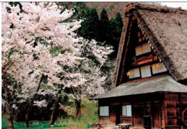
Gasshozukuri Minkaen Outdoor Museum, Shirakawago, Gifu Pref. 岐阜县白川乡“野外博物馆”合掌造民家園

白川乡和五箇山的民居风格迥异，白川乡的民居入口设在屋顶三角形的斜边侧；而五箇山的民居入口通常设在正前方。五箇山的屋顶坡度更陡，因为这里的降雪更厚，密度更大。如今仍然有许多人居住在这两个村落，您需要尊重当地人的生活方式（请不要擅自闯入稻田和住所，不要在窗前窥视），才能充分领略这其中的价值所在。