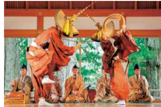
Kokiriko Festival, Gokayama, Toyama Pref. 富山县五箇山祭活动

village life, inns, and souvenir shops. Nine structures are preserved in Suganuma. The mountainous region gets two to three meters of snow, making winter transport difficult and Gokayama tofu a vital staple. Be sure to savor the taste of this traditional tofu, made so firm it can be tied with rope and carried around, as you enjoy other cultural features of the region including traditional folk songs, washi paper, and a variety of hot springs.