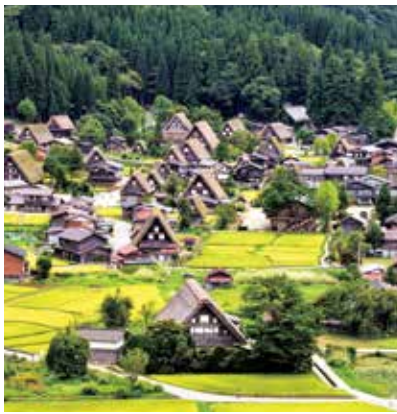
Shirakawago, Gifu Pref. 岐阜县白川乡

The architectural style of Gassho—the Japanese word for “two hands pressed together in prayer”—has steep-pitched triangular roofs that prevent excessive buildup of snow. The style was popular from the late 1600s to early 1900s in Gifu and Toyama prefectures. Building a dam in the Sho River valley flooded and destroyed many villages, so a conservation committee formed in 1971 to preserve the environs of Shirakawago Ogimachi, which led to Shirakawago being listed as a World