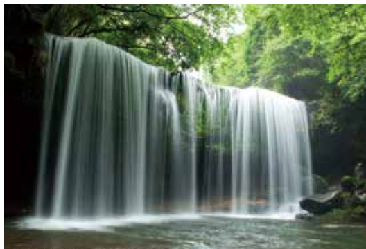
Nabegataki Falls, Kumamoto Pref. 熊本县锅泷瀑布

日本是由四个大岛组成的群岛国家，位于西南端的九州就是其中之一，它是这个国家的第三大岛，由七个县及一系列亚热带岛屿组成。这里的气候适宜夏日休闲，火山还造就了许多温泉度假胜地。欢迎您来到这片火之大地，体验缤纷的愉悦，让自己沉浸于这变幻万千的自然、独特的美食文化，以及陶器等传统手工艺品的世界之中。