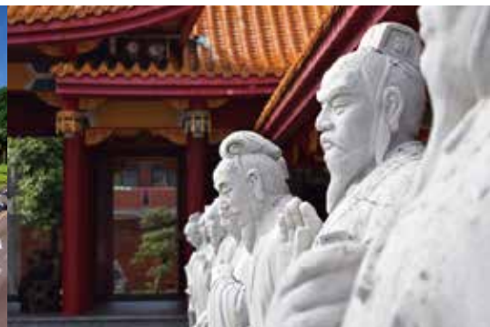
Confucian Shrine & Historical Museum of China, Nagasaki Pref. 长崎县的孔庙与中国历代博物馆