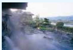
Harazuru Onsen, Fukuoka Pref. 福冈县原鹤温泉

Kyushu has about 35% of Japan's hot spring sources, with Beppu as a leading destination; Kagoshima Pref.'s Ibusuki Onsen, famous for its sand bath; Nagasaki's historic Unzen Onsen; and Fukuoka Pref.'s Harazuru Onsen, renowned for water that beautifies the skin.