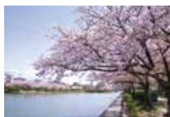
Saga Castle sakura, Saga Pref. 佐贺县佐贺城的樱花

Superb seascapes of varying coastlines and thriving calderas like Mt. Aso highlight natural attractions, including sunset and sea views on Kujukyu Island, cherry blossoms in spring, and maples in autumn.