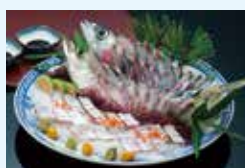
Seki mackerel, Oita Pref. 大分县的关鲭鱼

Enjoy seafood treasures like Saga crab, Oita Seki mackerel and horse mackerel, and Fukuoka long-tooth grouper; ramen, sara udon , and other noodles; Nagasaki castella ; Kagoshima beef; Jidori chicken; and the fine drink of shochu (Japanese distilled spirit).