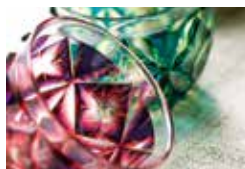
Satsuma Kiriko, Kagoshima Pref. 鹿儿岛县的萨摩切子

Experience crafts like renowned Arita and Imari pottery and Satsuma Kiriko cut glass; vital heritage in Kumamoto Castle, Yoshinogari Ruins in Saga Pref., and Miyazaki Prefecture's Amanoiwato Shrine; traditional performing arts; and local festivals.