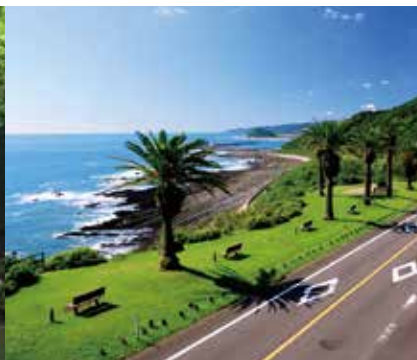
Horikiri Pass, Miyazaki Pref. 宫崎县堀切峠