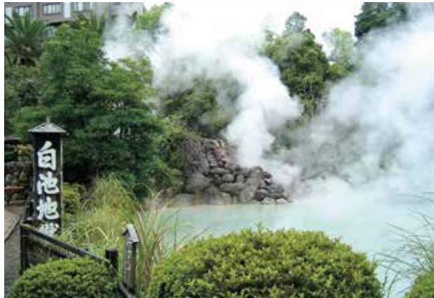
White Pond Hell, Oita Pref. 大分县白池地狱

在铁轮，您可以体验温泉“地狱巡”之旅，其中包括泉水呈钴蓝色的“海地狱”、“血池地狱”及其红色粘土和间歇性温泉“龙卷地狱”。此外，用温泉水打造的“地狱蒸”健康美食也是闻名遐迩。