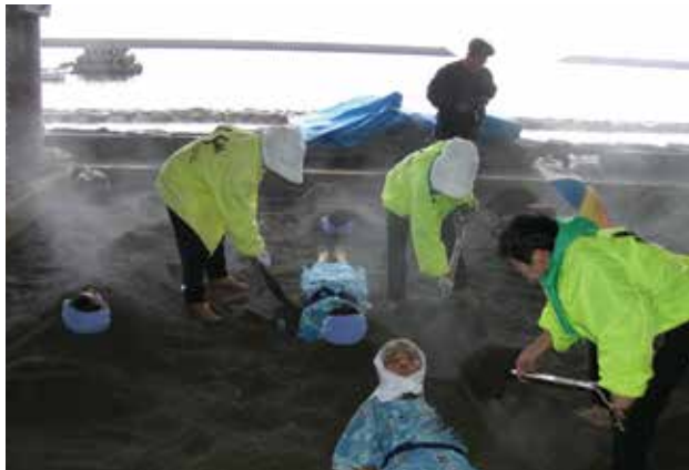
Attendants serve customers in steaming sand bath, Ibusuki City. 指宿市，工作人员为客人进行沙蒸