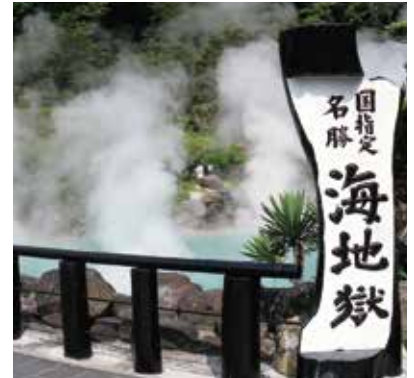
Sea Hell, Beppu City 別府市海地獄

In Kannawa you'll find the hot spot Tour of Hell with highlights like Sea Hell, made of cobalt blue water; Blood Pond Hell and its red clay; and Tornado Hell, a geyser type. It also is known for tasty, healthy food cooked by direct "hell steaming" ( jigoku mushi ) in its waters.