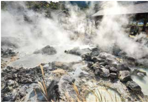
Unzen Hell, Nagasaki Pref. 长崎县云仙地狱

在夏日，云仙温泉凉爽的气候吸引人们竞相到访，在海拔 700 米的高度放松身心。这里四周被高达千米的群山环抱，云仙岳就在其中。