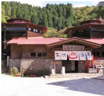
Kojigoku Onsen, Unzen City 云仙市小地獄温泉

A popular onsen resort in summer for its cool climate, Unzen Hot Springs offers refreshing relaxation at its 700-meter altitude, surrounded by 1,000-meter-high mountains including Mt. Unzen.