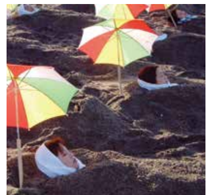
Steaming sand bath, Ibusuki City 指宿市沙蒸

Here is a form of relaxation enjoyed by young and old, whether luxuriating in hot water or the warm embrace of volcanic sand.